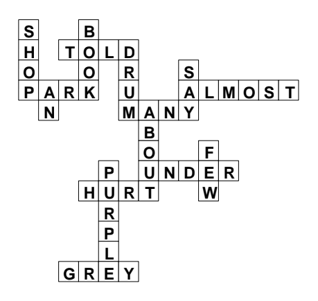
Crossword Across 3. told 6. park 8. almost 9. many 13. under 14. hurt 15. grey Down 1. shop 2. book 4. drum 5. say 7. an 10. about 11. few 12. purple